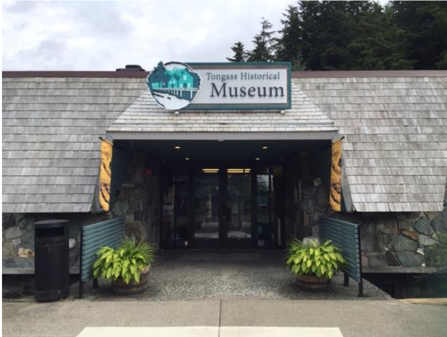
Figure 5 Main entrance of Museum