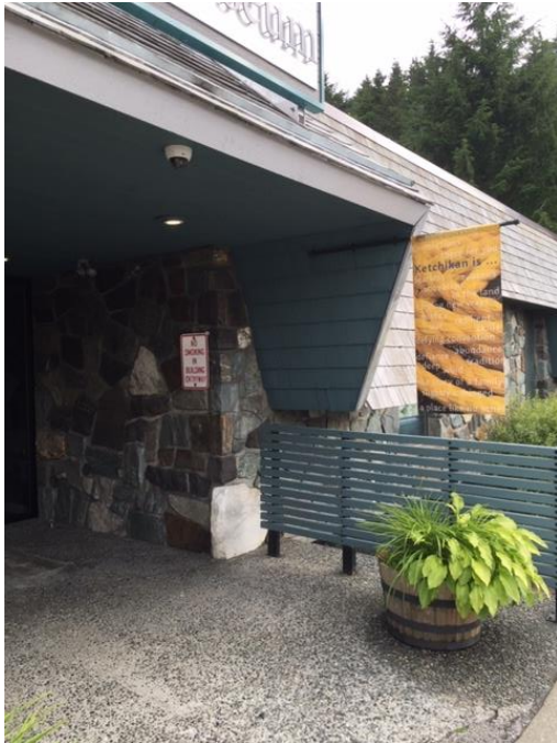
Figure 9 Right side of main entrance. Future ADA access button