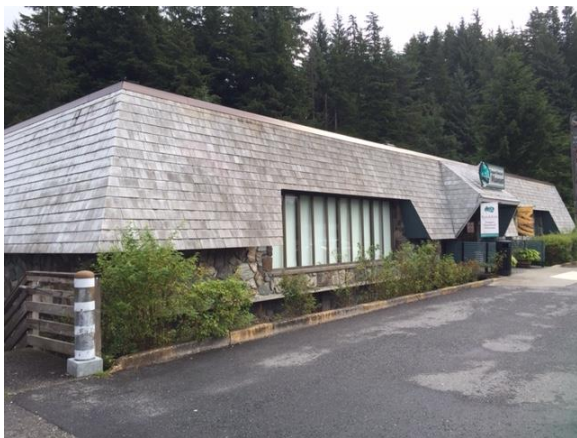
Figure 3 NW Corner of Museum, main entrance to the right