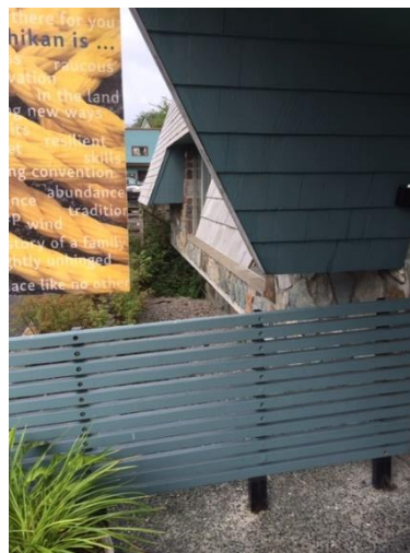
Figure 7 Left side of entrance showing drop off in front of windows