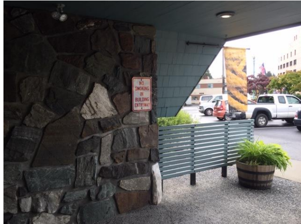
Figure 10 Right side of main entrance. Future ADA access button