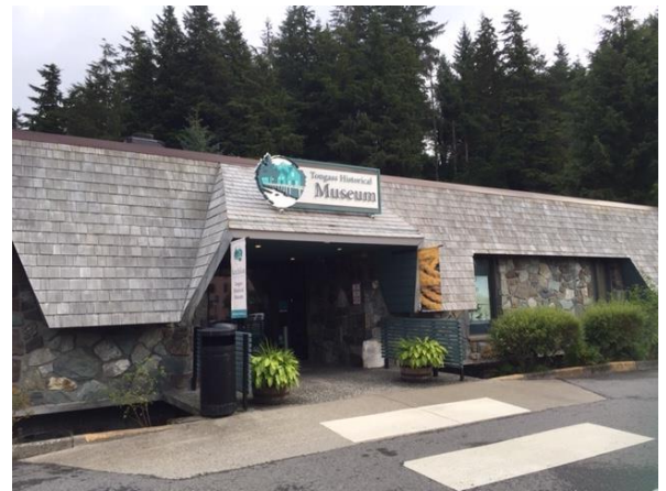
Figure 4 Main entrance of Museum