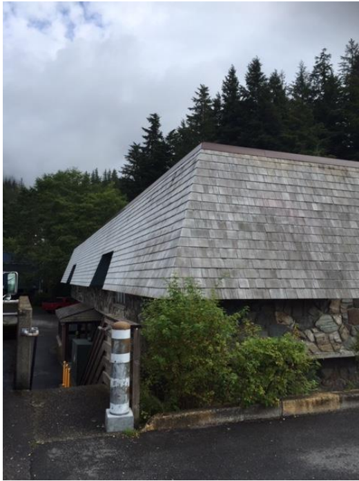
Figure 1 NW Corner of Museum