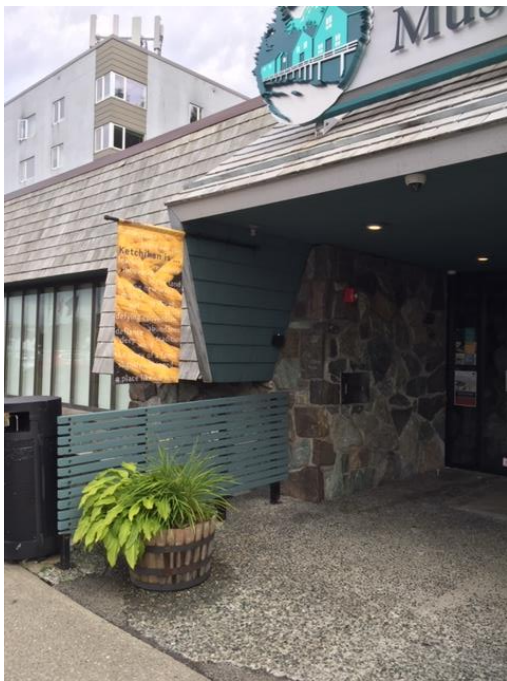
Figure 6 Left side of entrance with mail drop