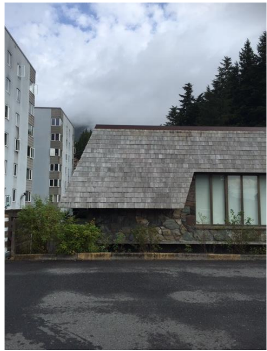
Figure 2 NW Corner of Museum