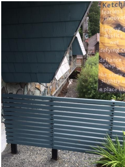
Figure 11 Right side of entrance showing drop off in front of windows