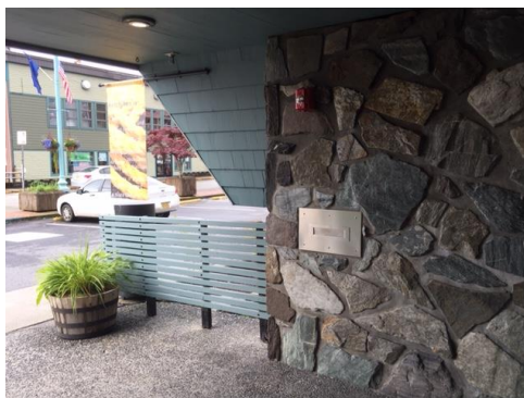
Figure 8 Left side of entrance with mail drop