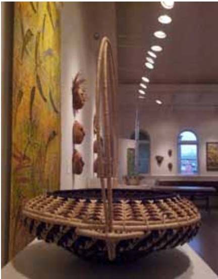
Woven Migrations, July 2012

The Arts Council is extremely thankful for the continued generosity of Guardian Flight, the Main Street Gallery's sponsor of the 2012-2013 Main Street Gallery Season.