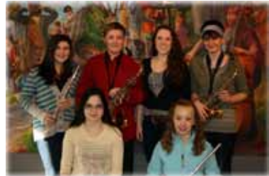
2012 recipients of the Sam Pitcher Memorial scholarships

Scholarships have been awarded annually with six scholarships in 2012. Tax-deductible contributions can be made to the Sam Pitcher Memorial Scholarship Fund c/o the Arts Council.