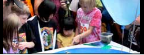
Artists L-R: 2008 Youth Art Show, The New Path Dancers, Blueberry Slug Race